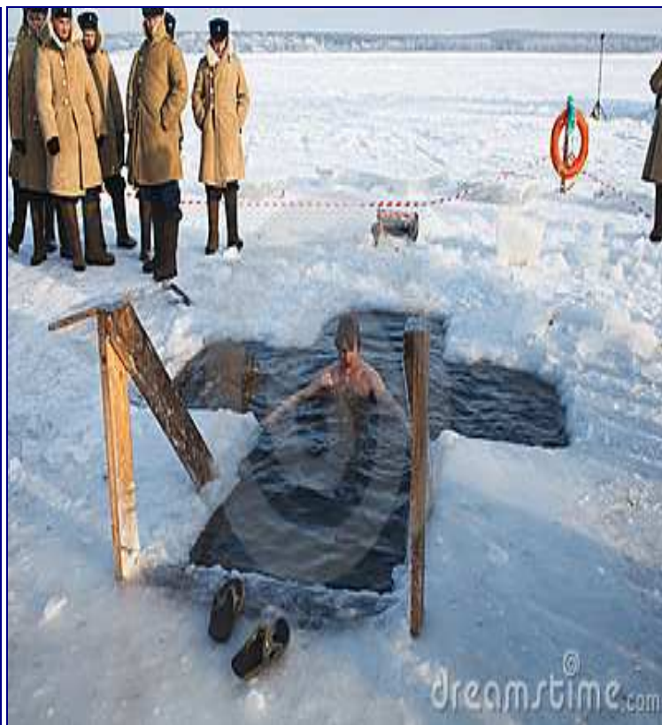
Blessing of the Waters Outdoors in Russia!